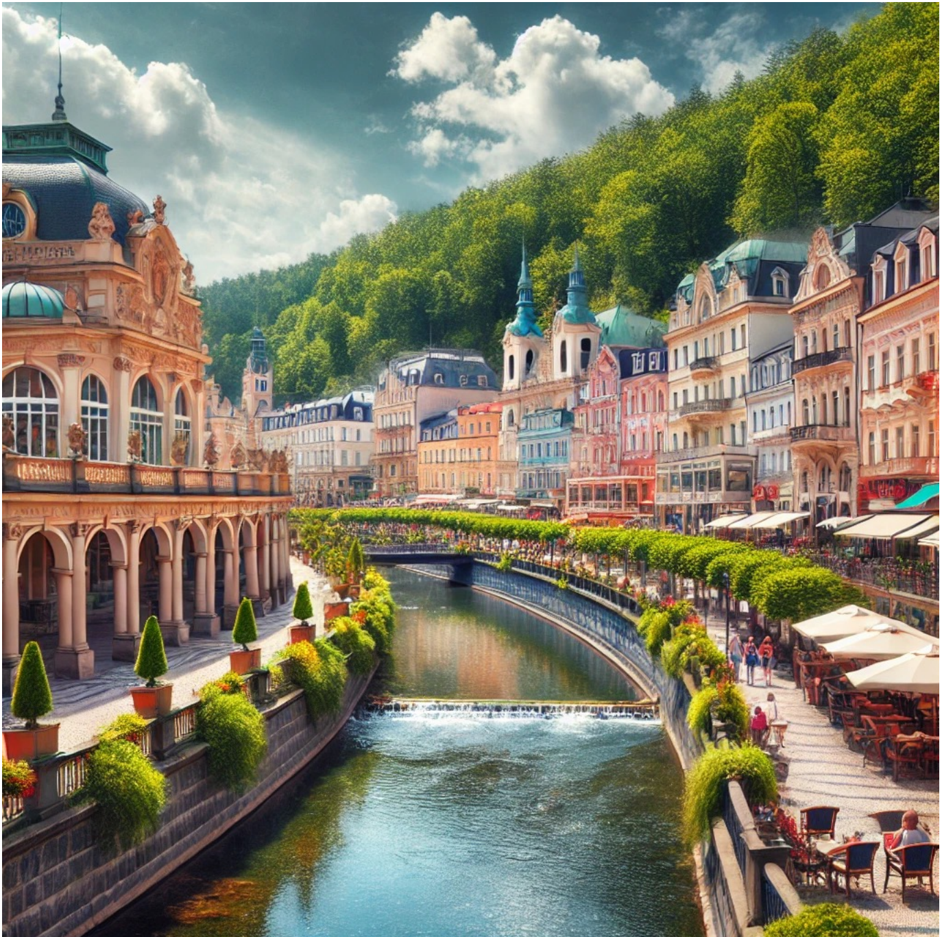
A picturesque view of Karlovy Vary, Czechia, featuring colorful historic buildings along the Teplá River. The scene includes the famous colonnades and spa town charm.