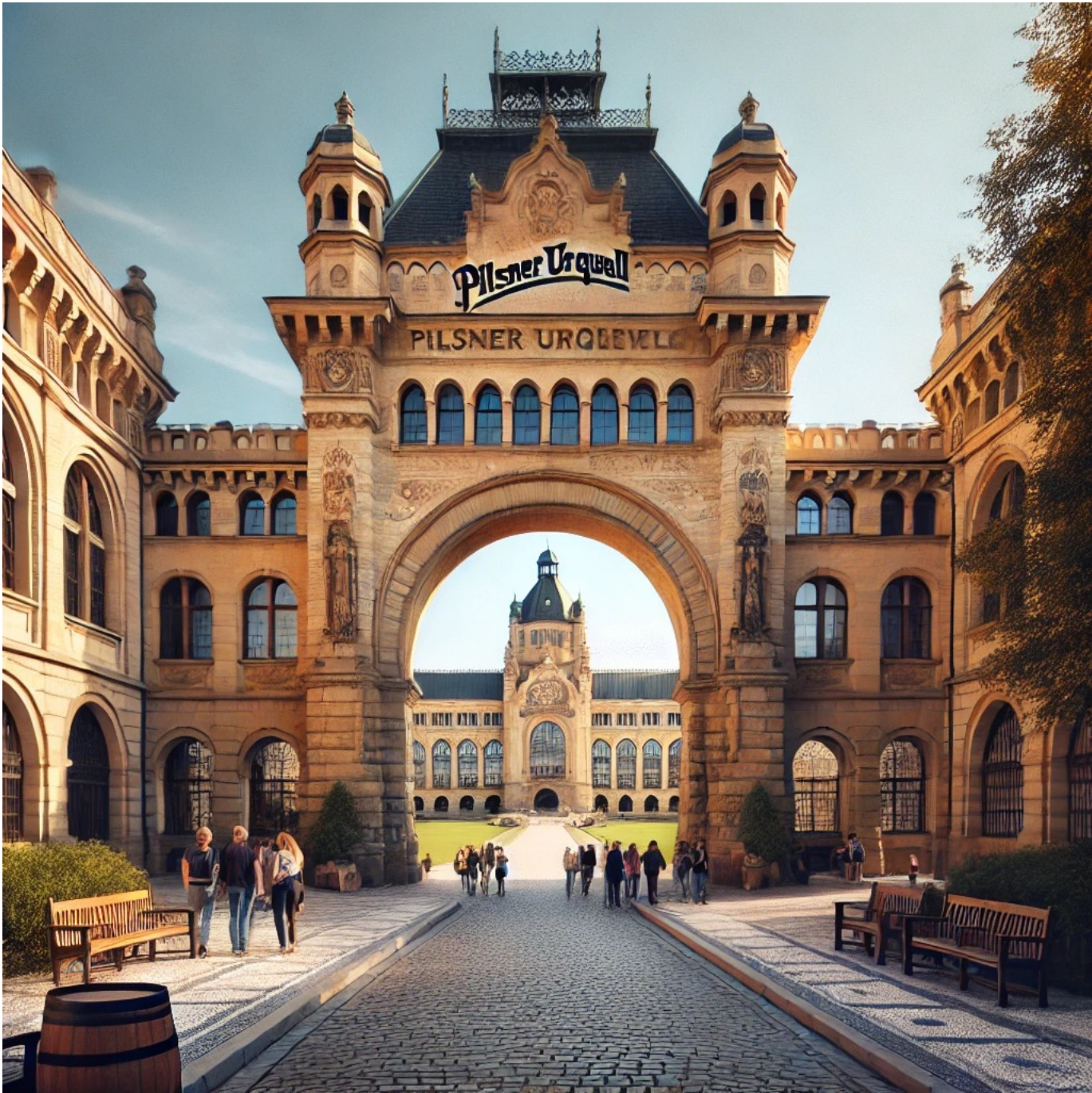
A picturesque view of the Pilsner Urquell Brewery in Plzeň, Czechia. The historic brewery building features grand arches, a large entrance gate,