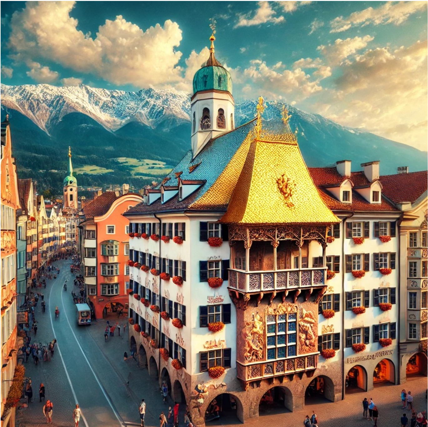
A scenic view of the Golden Roof (Goldenes Dachl) in Innsbruck, Austria. The historic building features its iconic gilded copper tiles, set in the charm of a mountain town.