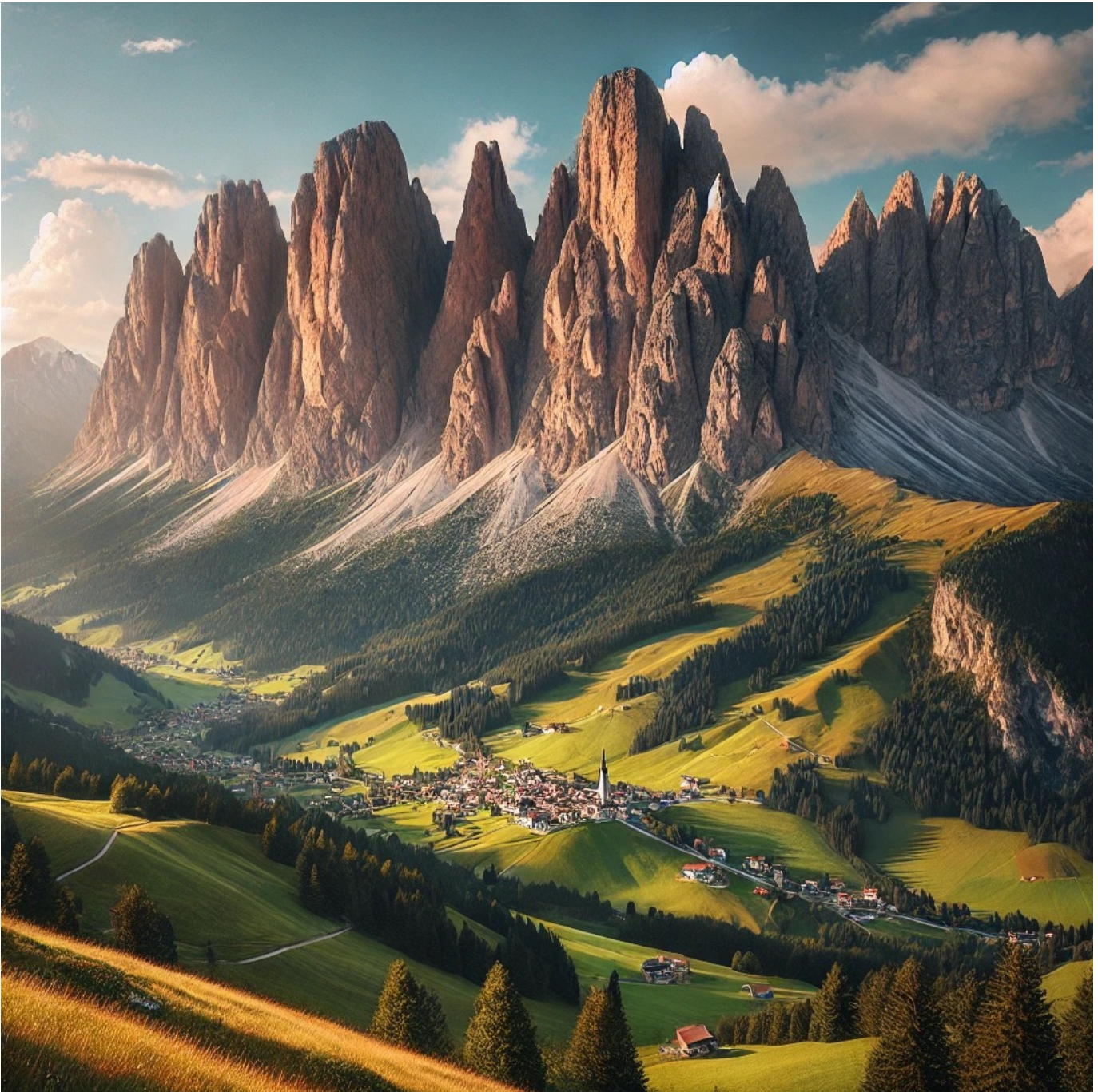
A breathtaking view of the Dolomites near Bolzano, Italy. The jagged mountain peaks rise dramatically against a clear blue sky, with lush green meadow.