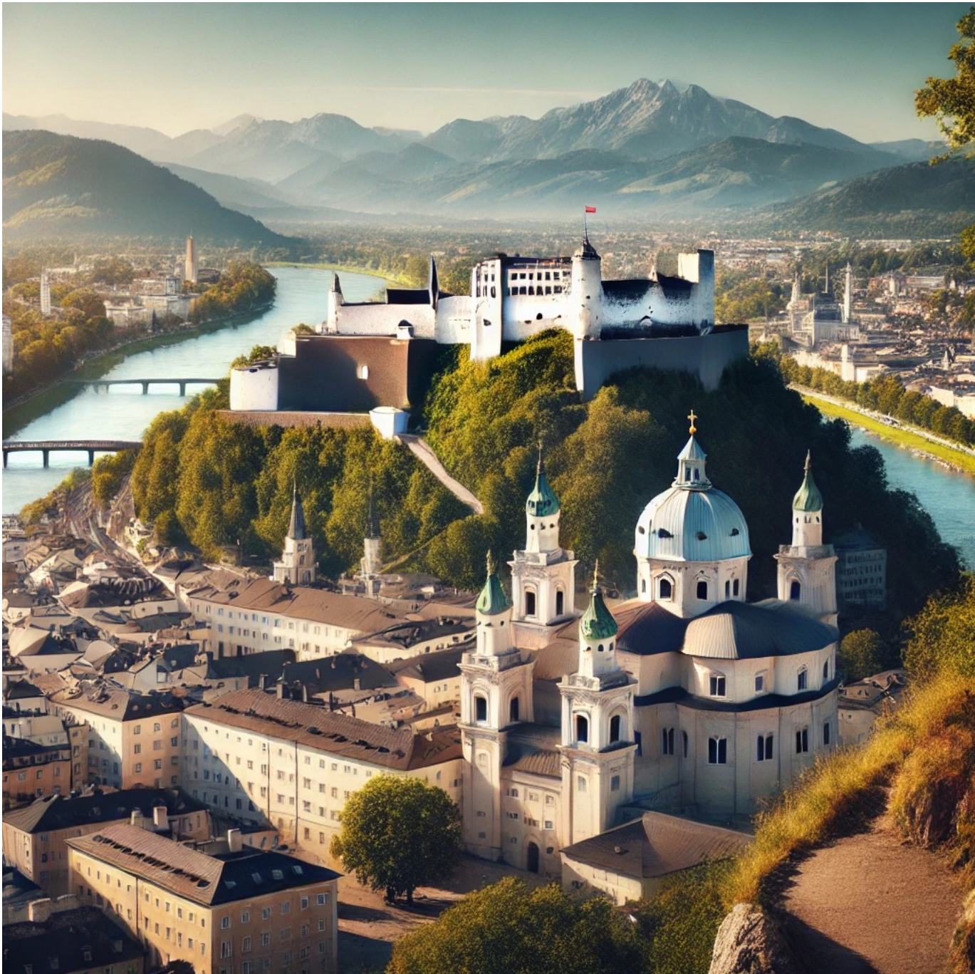
A scenic view of the Golden Roof (Goldenes Dachl) in Innsbruck, Austria. The historic building features its iconic gilded copper tiles, set in the cha