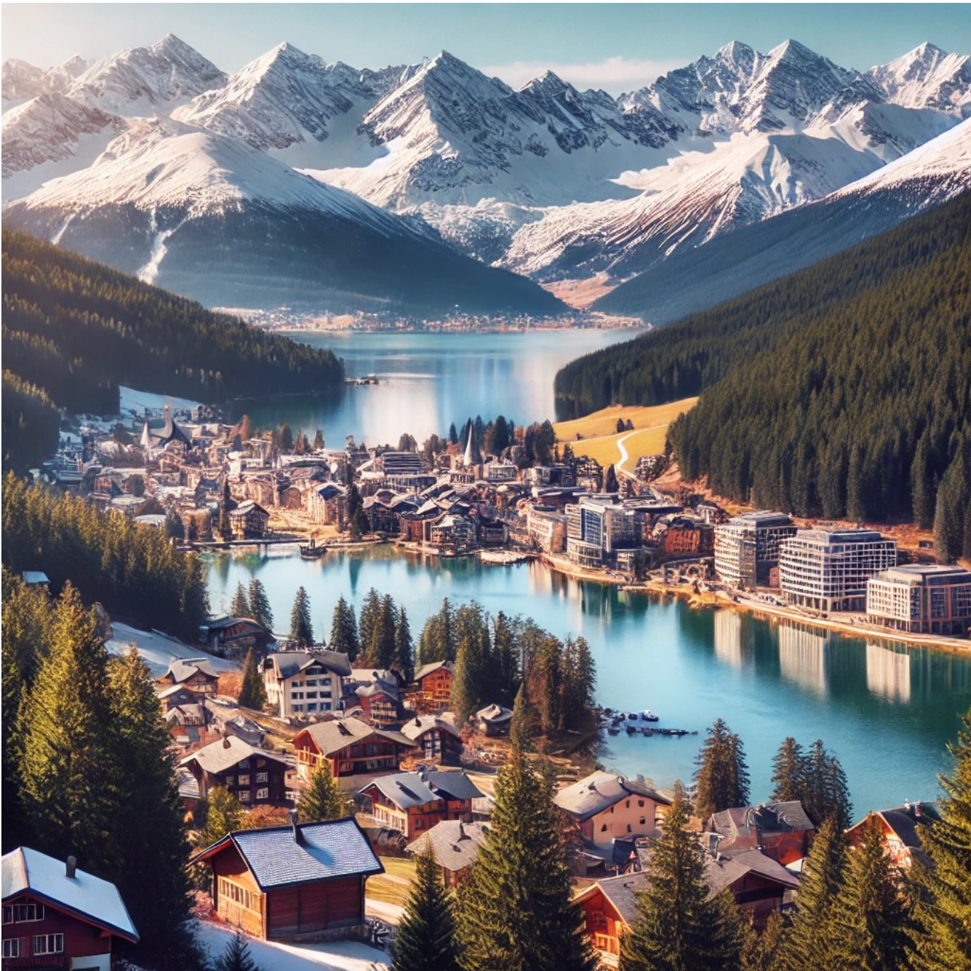
A stunning view of Davos, Switzerland, featuring a scenic alpine landscape with snow-capped mountains and a beautiful lake.