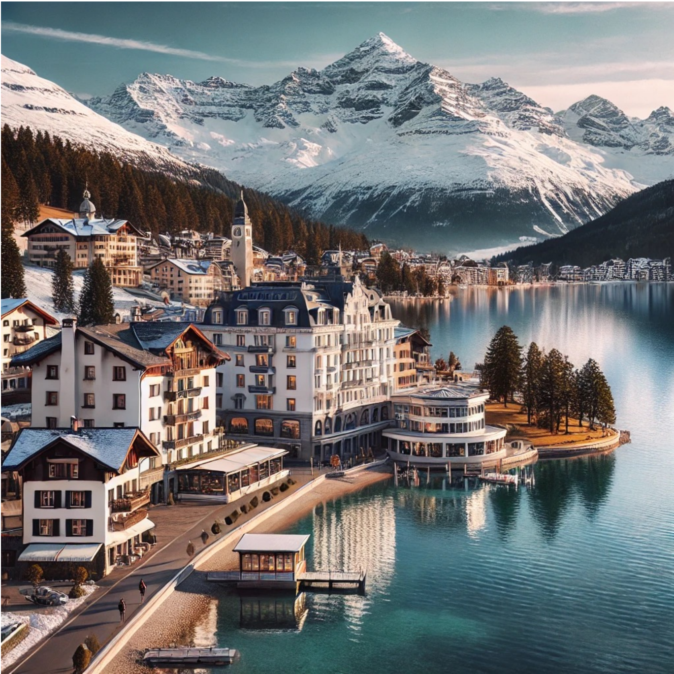
St. Moritz, Switzerland, showcasing its breathtaking alpine lake, luxury architecture, and mountain scenery.