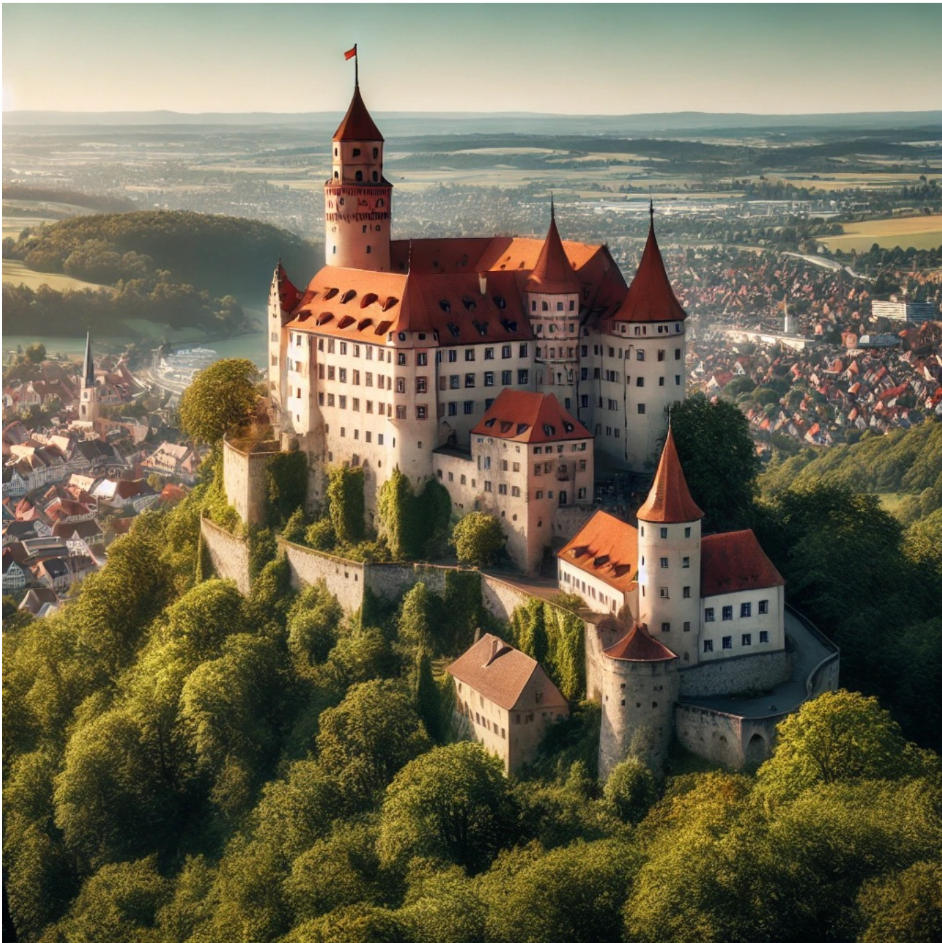
A scenic view of Trausnitz Castle in Landshut, Germany, perched on a hill overlooking the city. The castle's medieval architecture, red-roofed towers